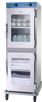
Shown with optional bumper