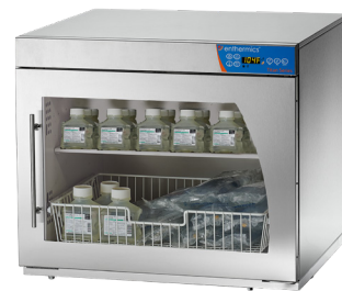
Unit shown with optional basket - set up for fluids