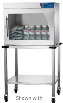
Shown with EC550BL 18" Depth Combination Warmer