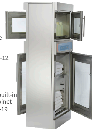
Shown as optional pass-through cabinet