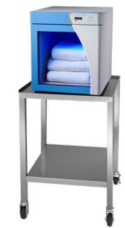
Shown with DC250 Blanket Warmer