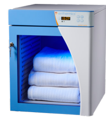
DC250 with optional lock

All blanket warmers utilize WarmSafe zone heating to ensure every blanket is safely and evenly warmed. With no fans or moving parts on the tabletop blanket warmers, they are engineered for years of reliable operation.