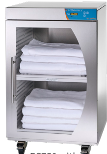
EC750 with optional casters