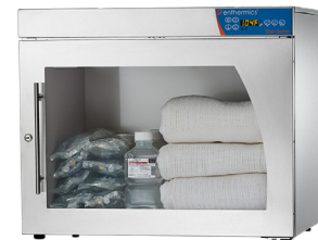
Unit shown with fluid bottles, bags and blankets for illustration purposes only