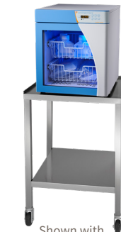
Shown with DC250L Fluid Warmer