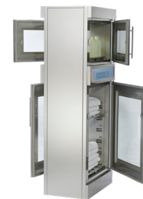
Shown as optional pass-through cabinet