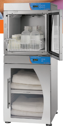
EC250L over EC350