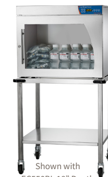
Shown with EC550BL 18" Depth Combination Warmer