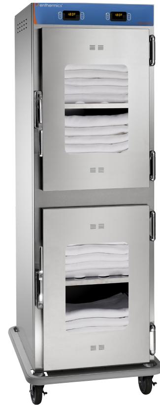
Shown with optional bumper